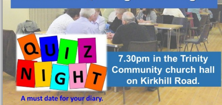
A must date for your diary.